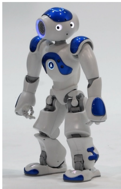
Figure 1. Humanoid robot NAO.

This project used NAO, a small (58 cm height, 4.3 kg), programmable humanoid robot developed by SoftBank Robotics (Figure 1). The hardware platform includes: tactile sensors, speakers, microphones, video cameras, and prehensile hands with three fingers. NAO has been used in a number of research studies with children on the autism spectrum with positive outcomes [21,42].